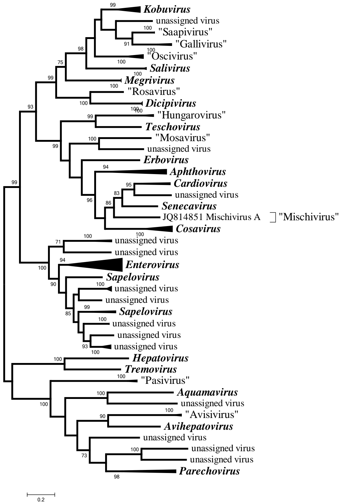
Figure 2. Maximum likelihood tree showing the relationship between picornaviruses in the 3D polymerase. Sequences were aligned using MUSCLE and the tree constructed using MEGA 5.2.